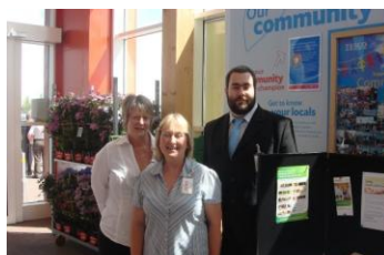
"Omega volunteers spread the Caring with Confidence message to Shrewsbury shoppers."

On 7 th August, the Omega volunteer team attracted great interest when they ran an awareness raising session at Tesco in Shrewsbury